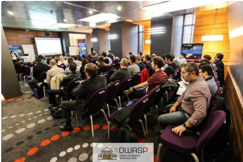
This OWASP Day's events were filled nearly to capacity