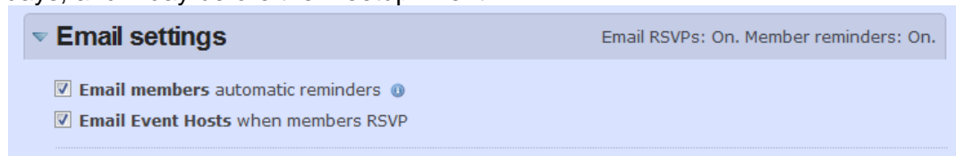
Figure 5: Email settings

Under “Email Settings” when creating a Meetup Event, you have the option to “Email members automatic reminders”. This will send them a reminder 14 days, 7 days, and 1 day before the Meetup Event.