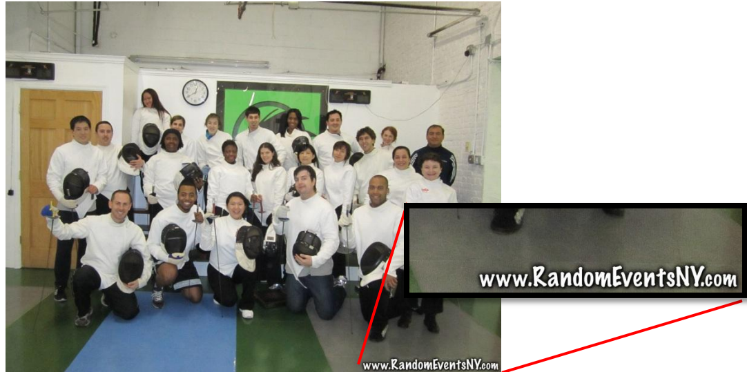
Figure 6 – Branding photos with a URL

Send a follow up email: After you have posted your pictures and uploaded your videos. It's time to send out an email to everyone who attended. The email should be brief and include: a thank you, kudos to anyone that helped out, asking members to fill out survey, links to the pictures and videos.