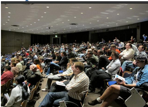
AppSec EU 2011