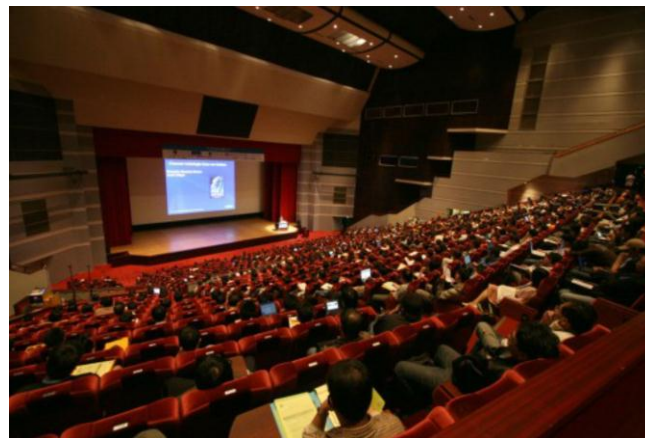
550 participants at OWASP India's past conference