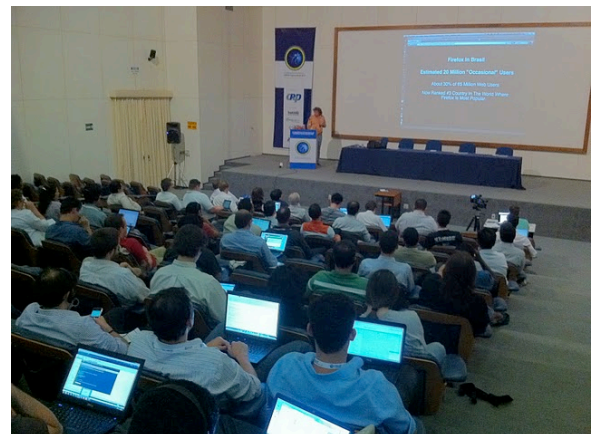
Overview of the public during the OWASP AppSec Brazil 2010 in Campinas, SP.