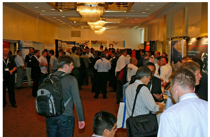
OWASP AppSec US 2008, NY.