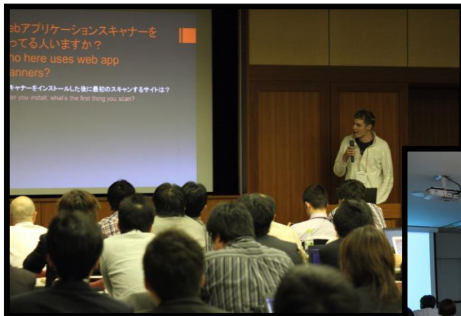
“OWASP Night” Meeting

Starting in 2012, approximately once every 3 months regular meetings have been held achieving a total participation as of November 2013 of over 2,000 people including developers, researchers, information governance managers, etc. Additionally, many companies have also provided support.